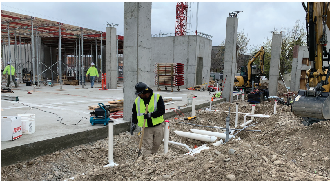
Harvey’s Plumbing saved an estimated 20% on The Merin job by prefabricating plumbing assemblies and spools in the shop using Allied BIM software and an automated laser positioning system.

Rausch also explained that using the Allied modeling and the TigerStop saw allowed them to limit wasted pipe sections to “just very, very small wafer pieces of pipe.” “I bet there’s at least 20 to 30% there in savings in PVC.” He added that an even larger savings came from fabricators not wasting time trying to salvage smaller pieces of pipe. “Traditionally, you’re going to have scraps and you’re going to have to pick up that scrap and try to cut up that scrap and use it.