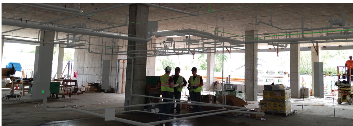
Allied BIM software, laser scanning, and a Microsoft HoloLens mixed reality headset allowed the Harvey’s team to be very exacting when it came to the design and installation of The Merin’s plumbing system, delivering a profitable project and meeting a tight deadline.